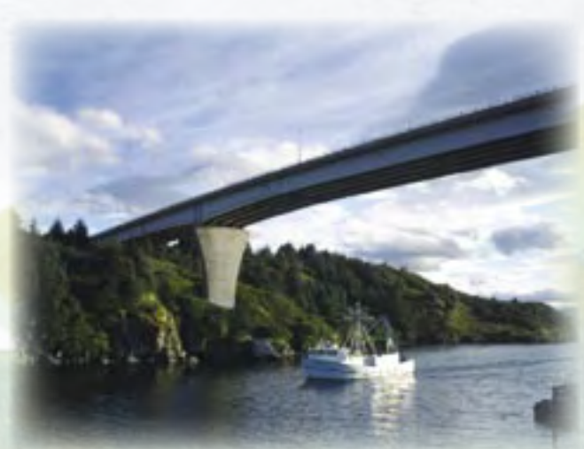
A Kodiak fishing boat passes under a highway bridge. Like most of the council's member communities, Kodiak is heavily dependent on commercial fishing.

The Information and Education Committee, formed in May 2008, has held seven meetings, one in person. The committee is working on a grant application for students; outreach ideas to replace the radio campaign which was cut from the coming year's budget; a possible update to the council website; assisting with outreach for projects from other committees, such as invasive species, community impacts planning, and geographic response strategies; and discussing ways to recruit volunteers. Plans have begun for events commemorating the 20th anniversary of the Prince William Sound Regional Citizens' Advisory Council on February 20, 2010.