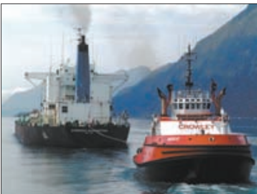
Each loaded tanker leaving Prince William Sound is accompanied by two escort tugs. As shown here, one tug is tethered to the tanker's stern for the most constricted part of the passage.