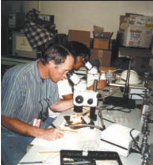
Ballast-water samples were collected and analyzed during the council's research into non-indigenous species.

The council has urged that these vapors be captured as well, so far to no avail. In February, the federal Environmental Protection Agency completed a lengthy rulemaking proceeding on air pollution from the terminal and opted not to regulate emissions from the bal-