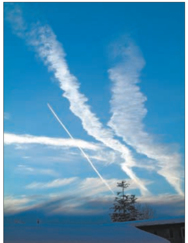
HOMELAND SECURITY came to Valdez in a big way in late December, when a security scare resulted in the Alyeska oil terminal shutting down for two days, and, as shown here, fighter jets patrolling overhead. The alert ended without incident after nine days and Valdez returned to normal.