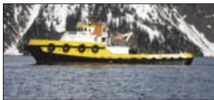
Alyeska's three Prevention and Response Tugs have been approved to return to primary escort duty. Shown here is the Alert , sister ship to the Aware .

The council and the other organizations working on the issue came to believe the fundamental issue was