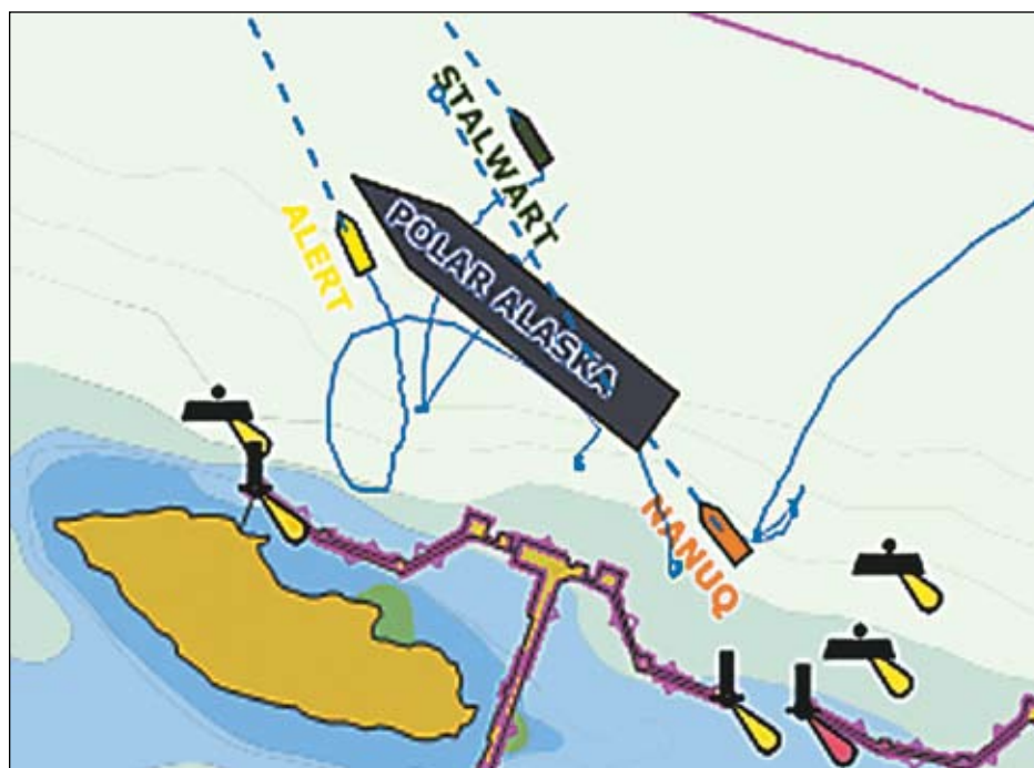
The council's Automated Identification System captured three tugs assisting the Polar Alaska as it left a loading berth at the Valdez terminal on Jan. 4.

On ships, the AIS information is usually overlaid on the vessel's radar screen for display. The council's Furuno system is connected to a conventional Windows computer, which produces