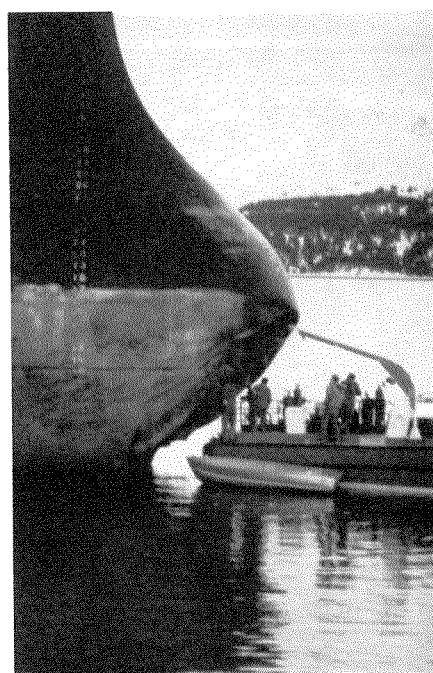
Workers in Valdez make temporary repairs to the damaged bow of the Overseas Ohio .

Two escort vessels already accompany laden outbound tankers and one of them acts as ice scout when conditions warrant. For inbound tankers, an ice scout - a SERV'S escort vessel equipped with the radar and searchlight - hooks up with inbound tankers at the pilot station or at the southern limit of ice observed or reported. The biggest change is for inbound tankers, since they have not had escorts in the past. The ice scout vessel runs one-half nautical mile forward of the tanker and radios back any ice sightings.