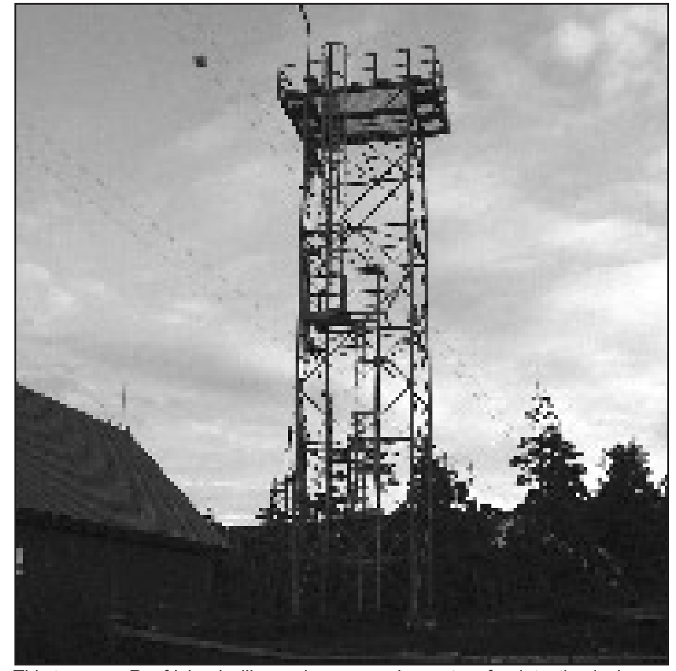
This tower on Reef Island will soon house a radar system for detecting icebergs in the tanker lanes.

The radar will scan west toward Columbia Bay to detect icebergs from Columbia Glacier that drift into the tanker lanes in Prince William Sound. This information will be transmitted to the Coast Guard and Alyeska Pipeline Service Co for warning tanker captains and other mariners when icebergs could pose a threat to shipping.