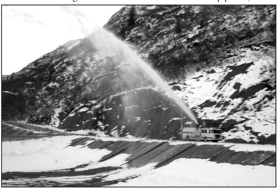
FIRE PROTECTION -- This truck participated in an October drill testing fire-fighting capabilities at Alyeska's Valdez tanker terminal.

NON PROFIT ORG. U.S. POSTAGE PAID ANCHORAGE, AK PERMIT NO. 836