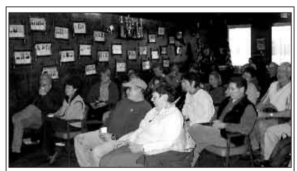
PEER LISTENERS —Cordova was the first council member community to receive Peer Listener Training with the council's new video. Here, residents watch the video at the Pioneer Igloo. See Community Corner, p. 6.

During the Valdez spill of 1989, large quantizes of oil did escape the Sound, fouling beaches