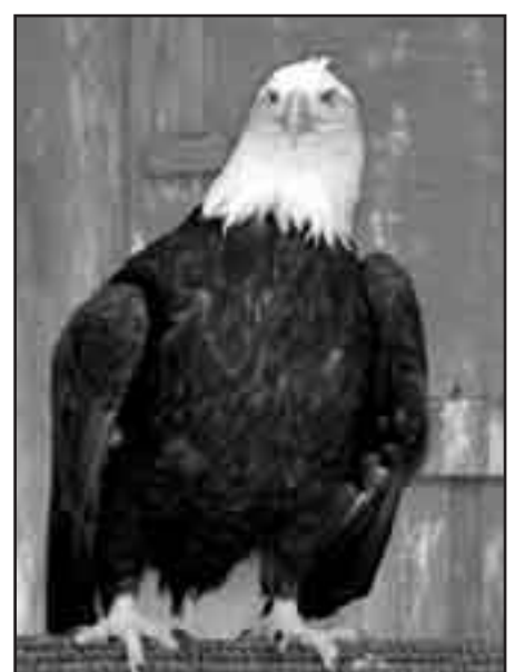
SNOWSHOE NOW — The eagle is ready to be shipped to a permanent home in an Albuquerque zoo.