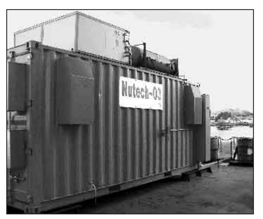
This module was installed on the Tonsina to generate ozone for the experiment in controlling non-indigenous species invasions.