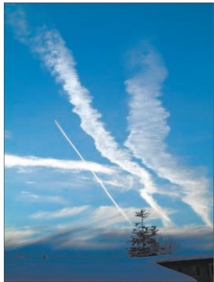
HOMELAND SECURITY came to Valdez in a big way in late December, when a security scare resulted in the Alyeska oil terminal shutting down for two days, and, as shown here, fighter jets patrolling overhead. The alert ended without incident after nine days and Valdez returned to normal.

The first double-hull tanker built for Valdez service under the Oil Pollution Act was the Polar Endeavour , now operated by ConocoPhillips. It carried its first load of North Slope crude out of the Sound in July 2001, marking a great day for Alaska and its environment. In fact, the ConocoPhillips tankers go beyond federal requirements. They are equipped with double