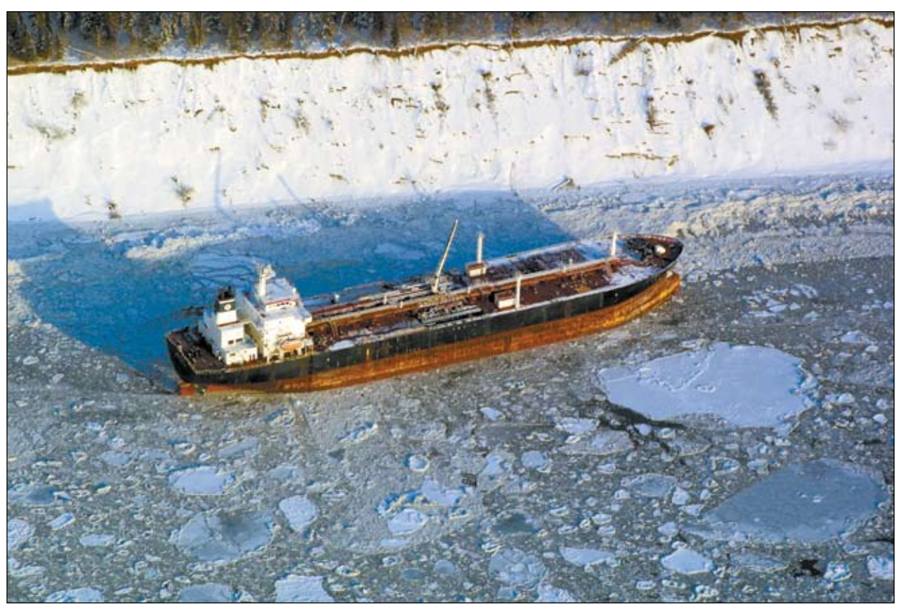
TWO HULLS – The Tesoro tanker Seabulk Pride grounded on a Cook Inlet beach near Nikiski early on the morning of Feb. 2. It was pulled off the next morning, without leaking any oil through its double hull. The incident has triggered fresh calls for tugs to assist with oil operations in Cook Inlet.

The incident prompted the Coast Guard to stiffen the rules for vessels operating in and out of Nikiski during winter conditions combining heavy ice and fast tidal currents.