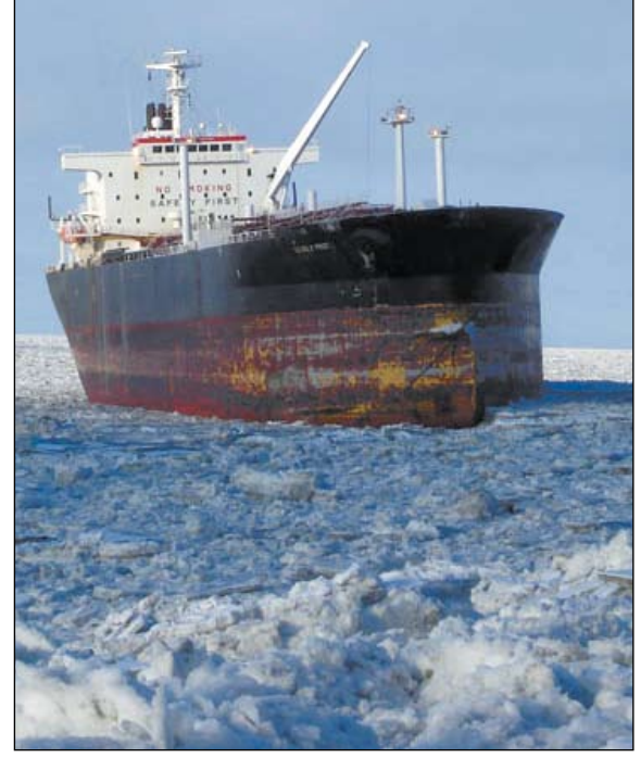
BEACHED — February's grounding of the tanker Seabulk Pride at Nikiski has renewed an old debate: Should Cook Inlet have tugs to assist with oil-industry operations, as is the case in Prince William Sound? See story, page 5.