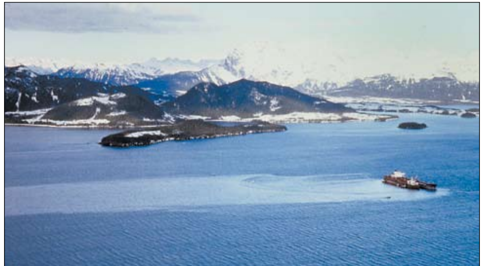
The Exxon Valdez spill of 1989 is an example of a marine disaster caused by human error.

The study lists several recommendations for finding out more about the human factor in oil spills, and reducing its role in accidents. They include – among other things – creating a mandatory near-miss reporting system; promoting and applying industry practices known to reduce accidents risks from