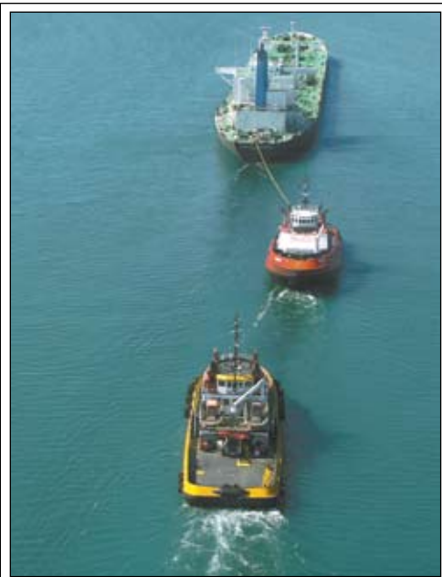
Besides assisting tankers in distress, Alyeska's escort tugs can also start the response to an oil spill.