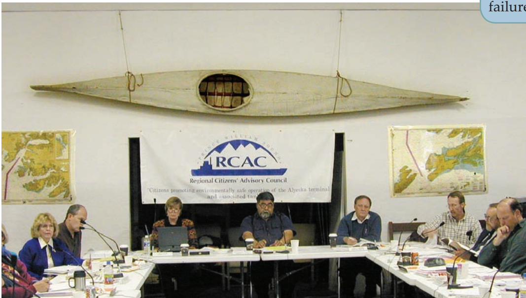
2003: Council board meeting in Cordova.

Council issues report on the role of human error in oil spills. The study finds that up to 80 percent of oil spills and other marine accidents can be attributed to human factors, either individual error or organization failure.