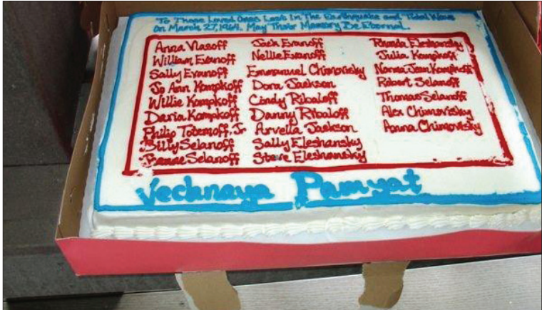
A cake baked for the memorial lists the names of those who died in the Good Friday disaster.