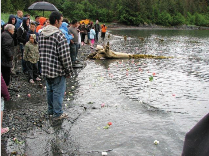
After the memorial service, flowers are thrown into the sea in memory of those who died in the Good Friday earthquake and tsunami waves of 1964.