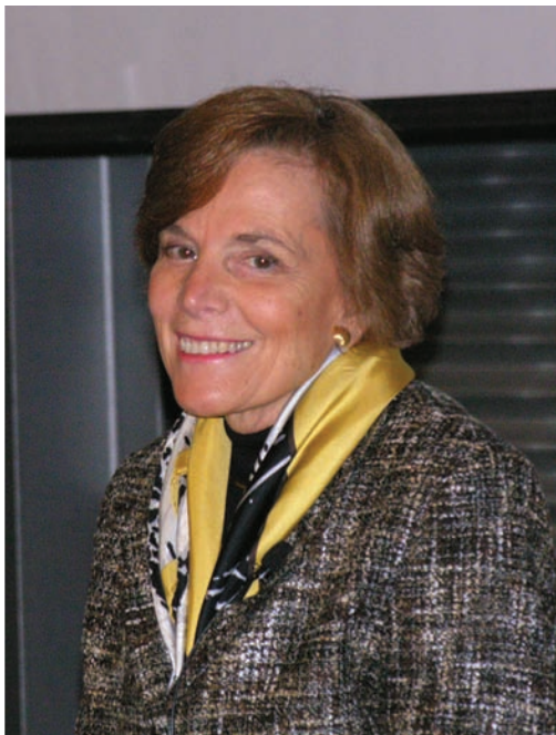
2005: Sylvia "Sturgeon General" Earle, oceanographer, explorer, author, lecturer and former chief scientist of NOAA was a guest lecturer at a council's volunteer meeting in December 2005.