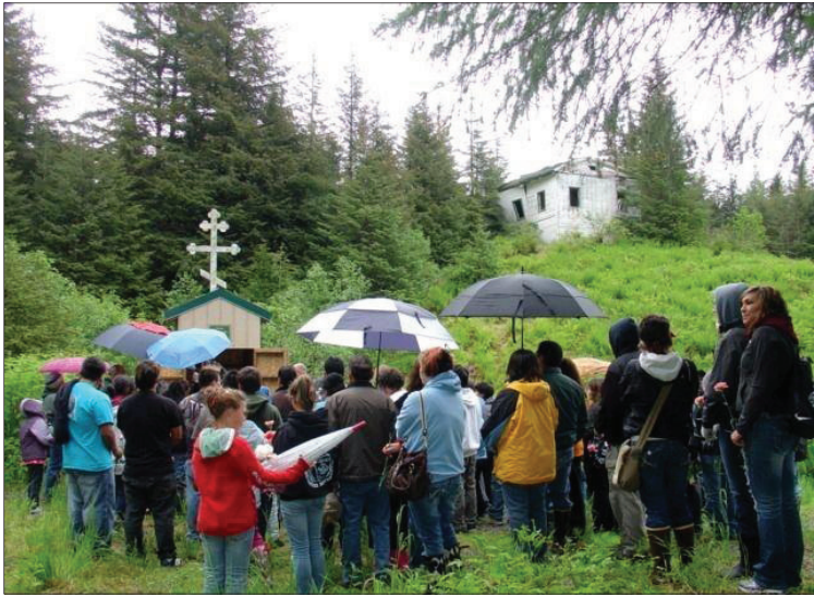
The village’s hilltop school was one of the few structures in Chenega to survive the devastation of the Good Friday disaster of 1964. Here, its crumbling remains overlook the memorial service 46 years later.