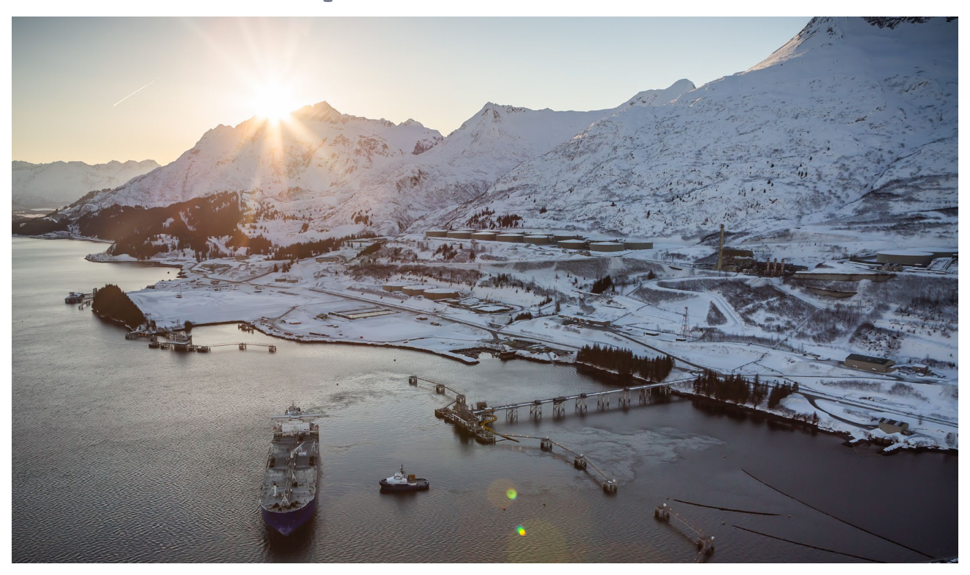
Prince William Sound Regional Citizens' Advisory Council Board Meeting May 04, 2023