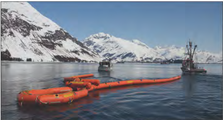
Left: Crews spend one day on the water practicing response techniques. Here, two fishing vessels practice pulling a "buster" oil spill boom system during the Valdez training. SERVVS' spill response tool-box contains differ-

as Kodiak, Seward, Homer, Kenai and other smaller communities as part of the program. There are over 400 vessels and their associated crews on contract. The vessels' crews attend three days of training each year, including classroom lectures, hands-on experience with equipment, and on-water exercises.