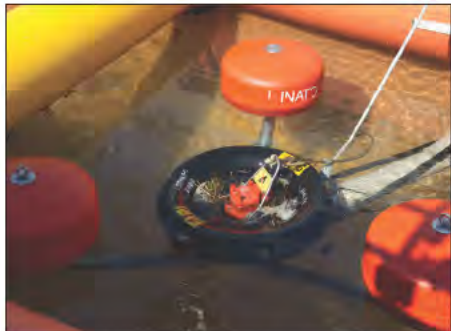
Above: Close-up of a weir skimmer in the collection area of the buster system.