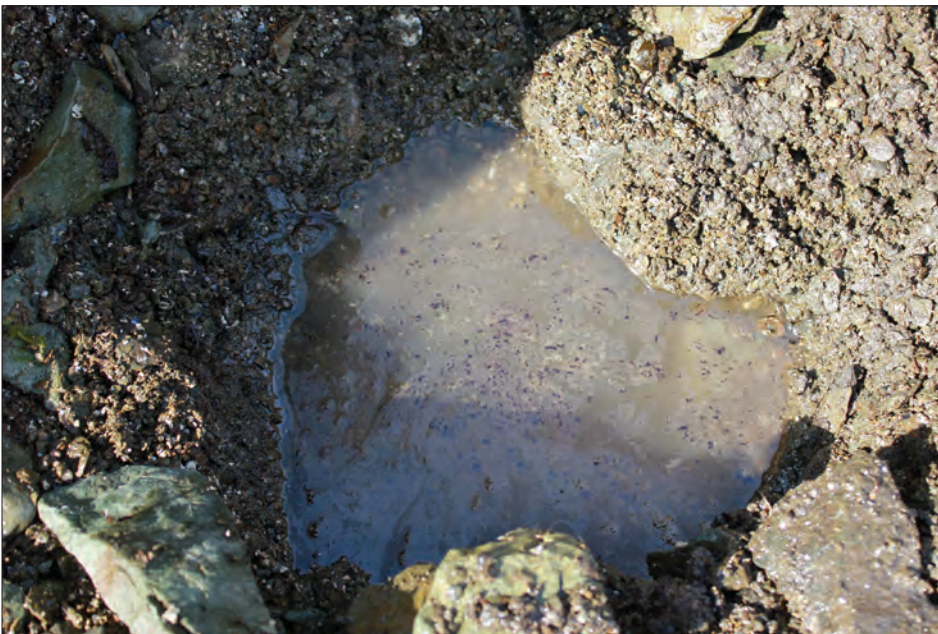
Oil lingers just a foot under the surface of the beach in some places. The oily water in the photo above was just a few feet from the water's edge at low tide. At a location farther up the beach, thicker oil seeps out of the sediment (below).