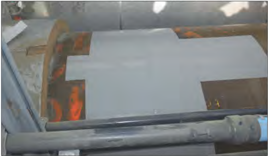
Once the corrosion is cleaned from an affected girth weld, the weld is recoated and then the exposed pipe segment is re-insulated with a protective barrier that prevents the introduction of water. The girth weld shown is ready to be re-insulated.