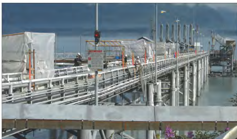
Causeway to Berth 4 at the Valdez Marine Terminal. Scaffolding has been installed and covered with plastic tarps to keep Alyeska's inspection crews and exposed piping dry during inspection.

Some of the council's concerns regarding the unknown condition of the crude oil piping at the Valdez Marine Terminal have been answered by inspections performed this summer by Alyeska.