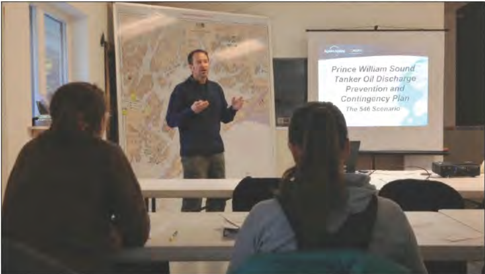
Above: An instructor teaches vessel crews about the tanker oil spill contingency plans during the Cordova training last Spring.