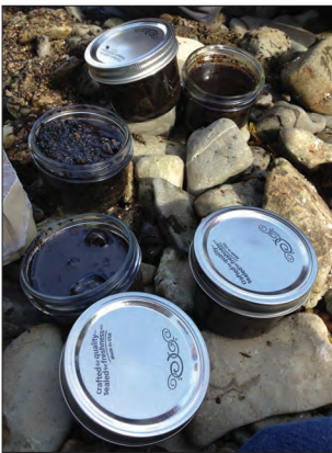
Below: Jars of oil were collected for display in council offices and at outreach events.