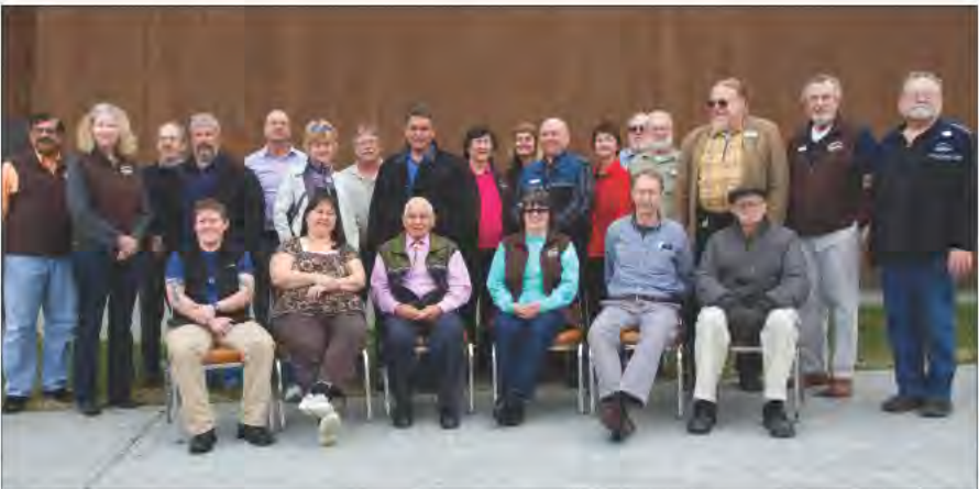
Members of the council's board and committees at the May 2012 meeting at the Valdez Civic Center.

You may contact either council office for a printed copy: Anchorage, 907-277-7222, or Valdez, 907-834-5000.