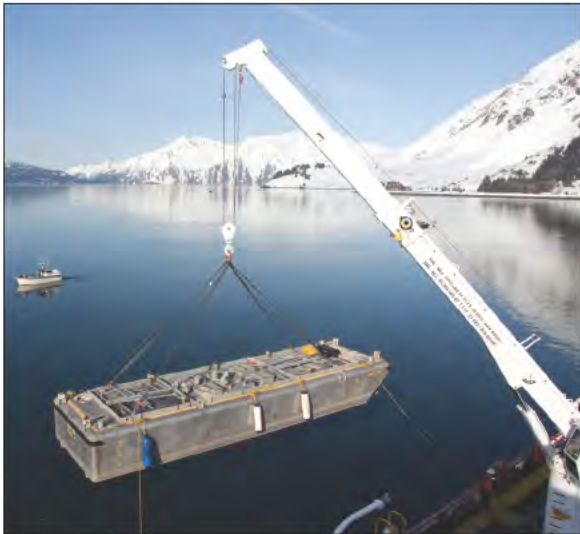
Left: Small temporary storage barges, known as mini-barges are used to hold the oil and oily water mix that would be recovered by the fishing vessel fleet during a spill response. These smaller barges would be offloaded to larger tank barges as they were filled. The main support barge for nearshore recovery operation, known as the "500-2," has twelve such mini barges onboard. The 500-2 is shown here setting one to the water during the Valdez training.