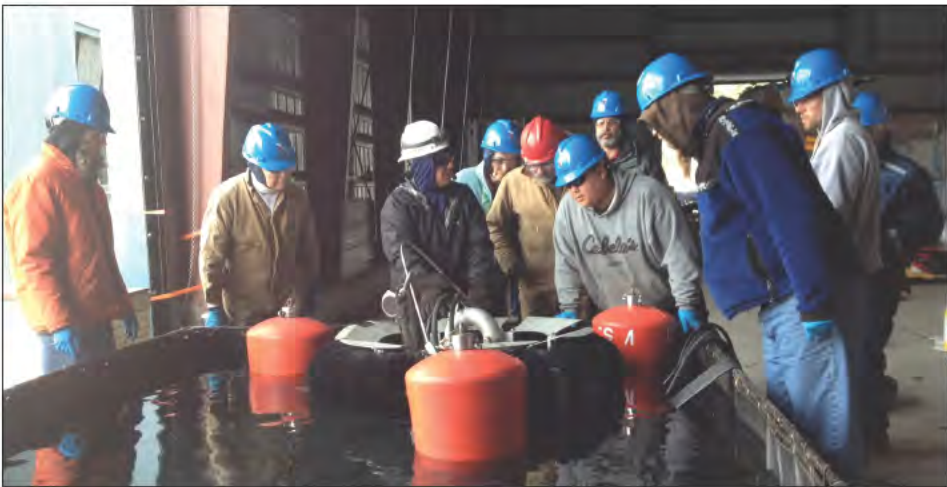
Above: Fishing vessel crews learn to set-up and run a small brush skimmer during this year's Spring training in Cordova.