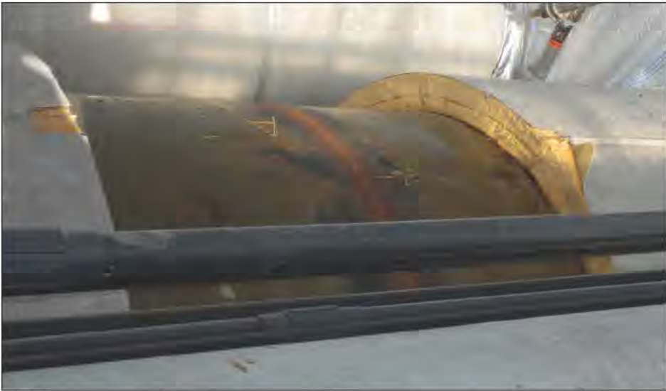
Girth weld in the crude oil piping to Berth 4. The weld is showing superficial amounts of corrosion that does not materially affect the integrity of the weld. The coating applied to the visible piping segment during construction appears to be in remarkably good condition.

The bottom line is that the council’s immediate concerns regarding the unknown condition of the over water piping have been allayed to a considerable extent by Alyeska’s recent inspection activities and the excellent overall condition of the pipe that has been observed. The need to inspect and quantify the presently unknown condition of the remainder of the 35-year-old piping at the terminal remains. The council looks forward to hearing more about Alyeska’s in-line inspection technology plans for the terminal as that project progresses.