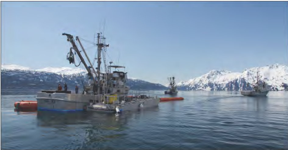
Above: Three boats are shown here in a typical oil recovery formation during the Valdez training. The farthest pictured vessels are pulling the buster system forward. The outstretched legs of the buster collect the oil and direct it into the collection area. The closest vessel manages the skimmer and the transfer of product into the mini-barge, tied alongside.