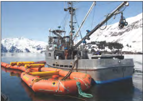
Above: The buster, shown here during the Valdez training, has a collection area at the rear and a skimmer can be set inside to recover oil and oily water. Photo by Jeremy Robida.

ent boom systems for different conditions. The buster is the newest generation of boom systems. While it has its own limitations, the buster can be towed faster, better handle rougher water, and collect and hold recovered oil better compared to more traditional booms. Photo by Jeremy Robida.