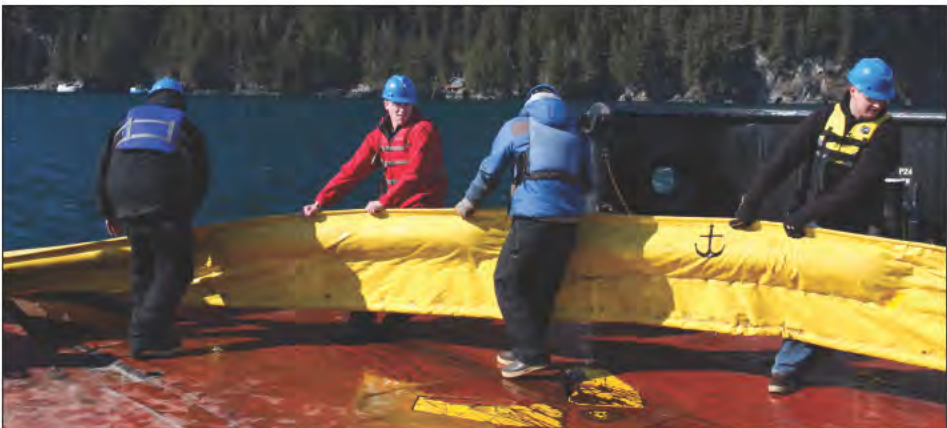
Above: Participants help recover boom during this year's training in Seward.