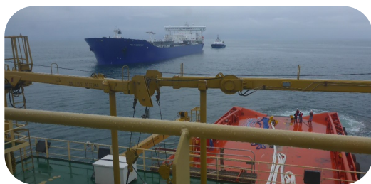
Polar Endeavour viewed from Ross Chouest