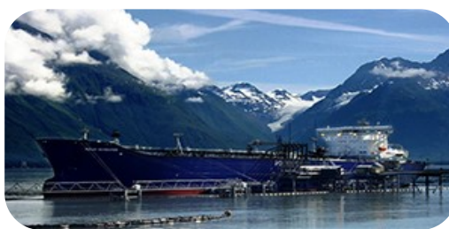
Polar Resolution at VMT berth