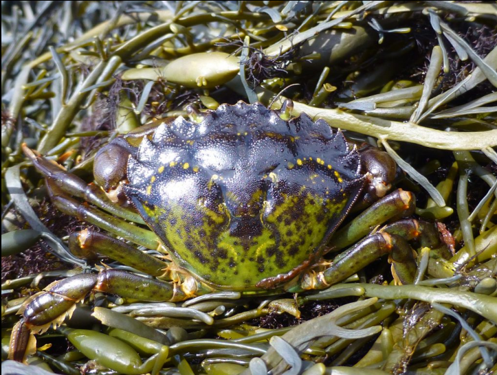
European green crab