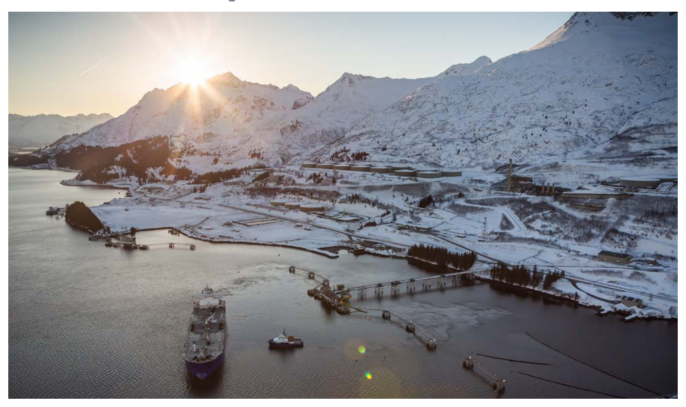
Prince William Sound Regional Citizens Advisory Council Board Meeting September 17-18, 2020