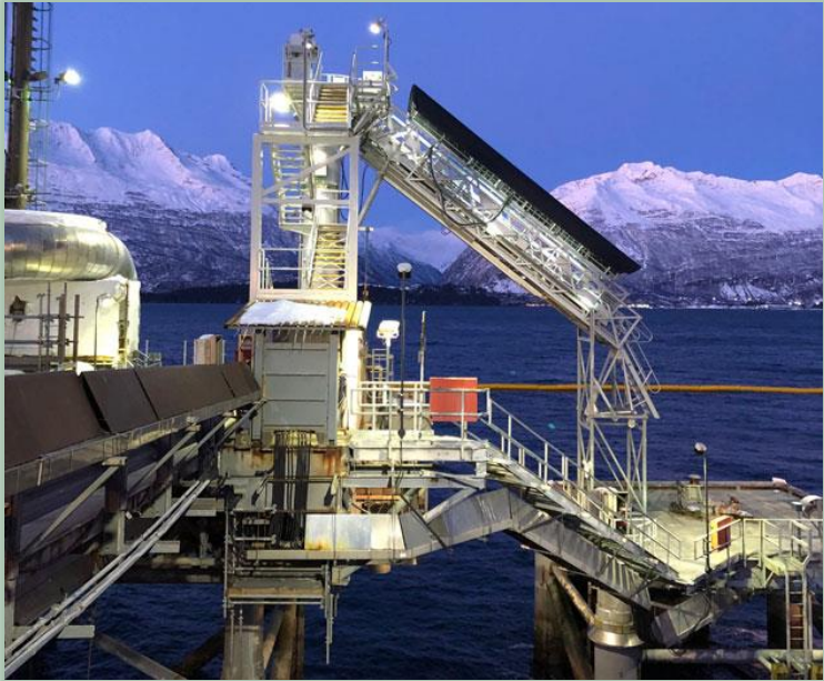
Berth 4 Gangway