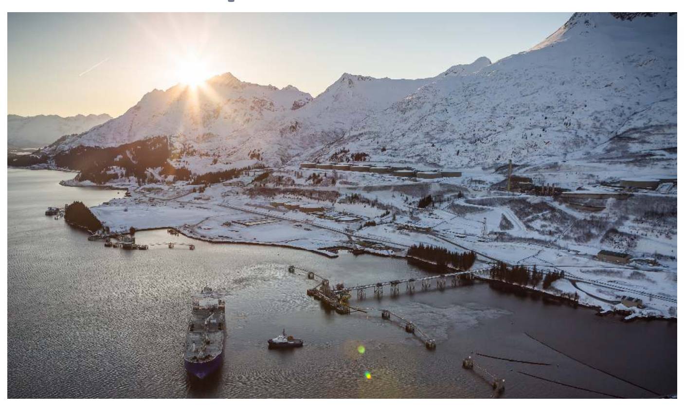
Prince William Sound Regional Citizens' Advisory Council Board Meeting January 26, 2023