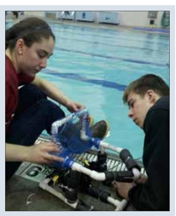
Valdez students make adjustments to a remotely operated vehicle they designed and built during a recent program by the Prince William Sound Science Center. The students used the vehicles to respond to a mock oil spill. For more on this program, see page 6.

During the first phase of the public review, the council submitted requests for additional information to the Alaska Department of Environmental Conservation, the agency in charge of the review process. The council was looking for more information on prevention and response training, facility descriptions, and additional details on preventing a spill.