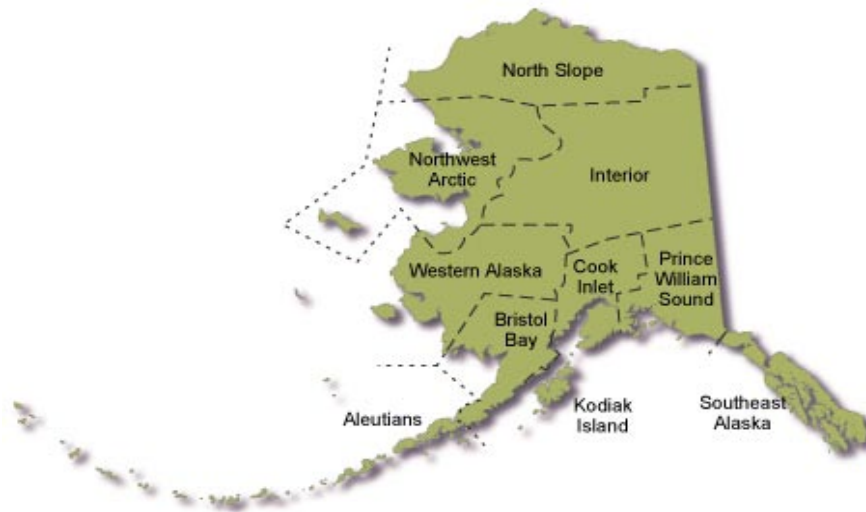
Figure 1. Alaska Subarea Boundaries

Figure 1 is a graphic depiction of the Alaska regions, or Subareas, for oil spill response planning.